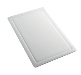
HPDE Chopping board 8657 001