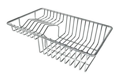
Stainless steel plate rack 8100 303 * only in combination with the accessory 8644 101